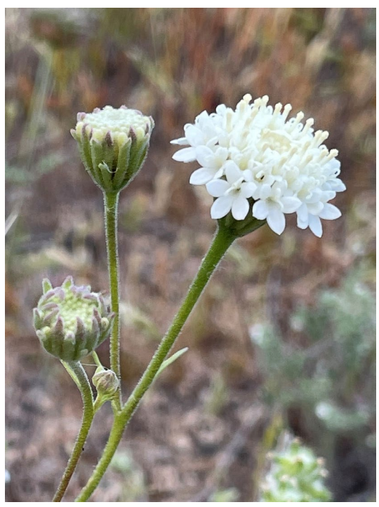
▲ Desert pincushion

If Ralph Waldo Emerson was correct that "the earth laughs in flowers," then it must have been slapping its thighs and positively howling with mirth the past few weeks at the ranch. February's abundant rainfall led to a spectacular array of species and colors all around the lake, ciénega, and the 30-acre restoration area east of the ranch.