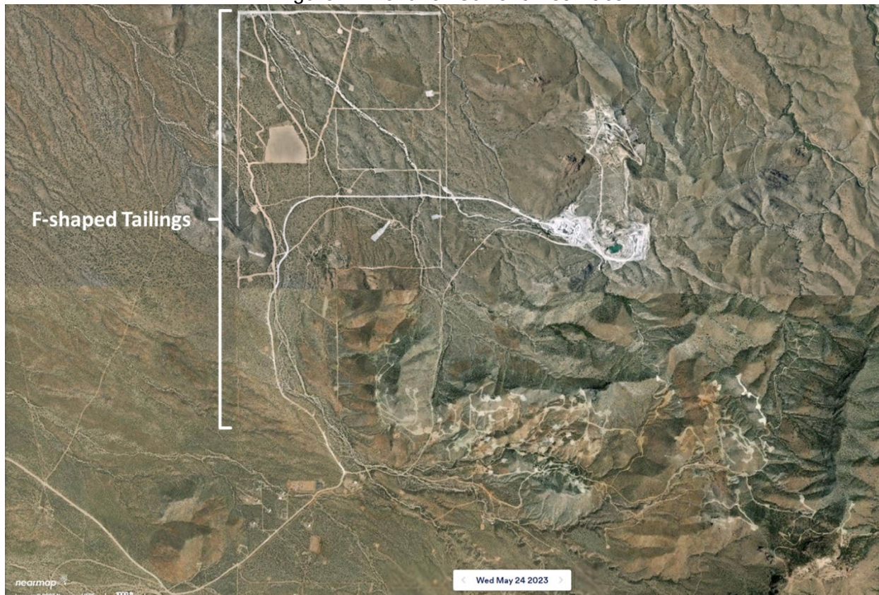
Figure 1. Aerial of Current Activities

The last comprehensive update I provided to the Board on Hudbay's Copper World project was on January 17, 2023 . I also provided memorandums concerning Hudbay's application to the Arizona State Land Department to acquire State Trust land on April 17, 2023 and April 3, 2023 . Since then, I have met with the State Land Commissioner and Hudbay representatives. This memorandum provides an update on these meetings, including Hudbay's current planning timeline, the status of permit applications and existing permits, status of their application to acquire State Trust Land, recent images of the project area (Figure 1), and a summary of ongoing public concerns.