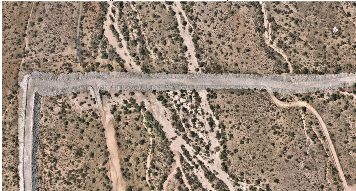
Figure 2. Close-up of berm crossing 60-foot wide channel that has a 100-year peak flow rate greater than 5,000 cubic feet per second.

Hudbay has also begun preparations for the F-shaped tailings called TSF-1 by preparing a perimeter berm (Figure 1, light colored outline). Three washes have been blocked by the berm that range in width from 20 to 60 feet, one of which has a 100-year peak flow rate of greater than 5,000 cubic feet per second (cfs) (Figure 2). State Law exempts tailings and waste rock piles from the requirement to receive written authorization from the County or Flood Control District.