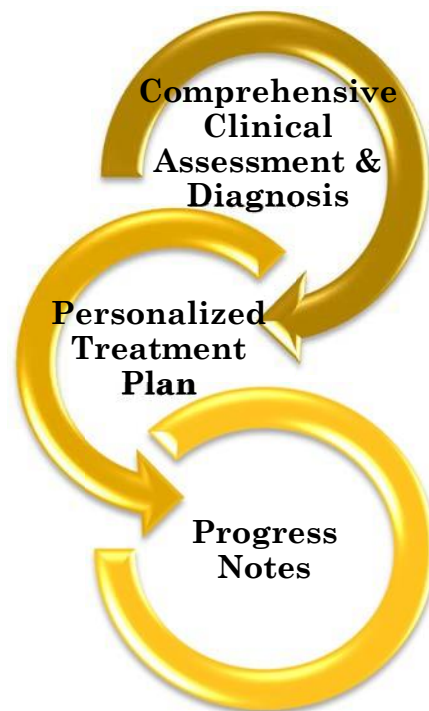
Figure 1.1 “The Golden Thread” of Clinical Documentation

All documentation must follow a logical flow and be interconnected. To illustrate this concept, Figure 1.1 depicts The Golden Thread :