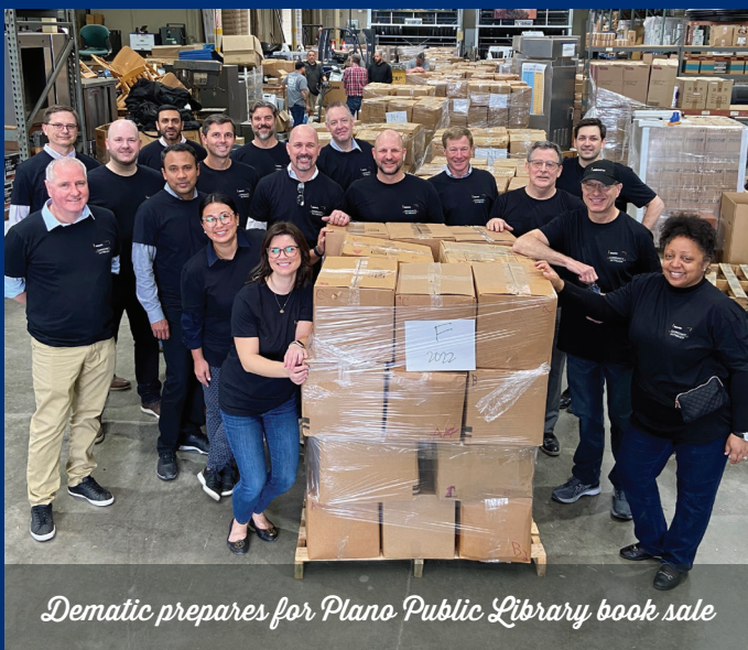
Dematic prepares for Plano Public Library book sale

19 FAMILIES (97 INDIVIDUALS) RECEIVED CLOTHING, TOYS, BICYCLES, HOUSEHOLD SUPPLIES AND MORE