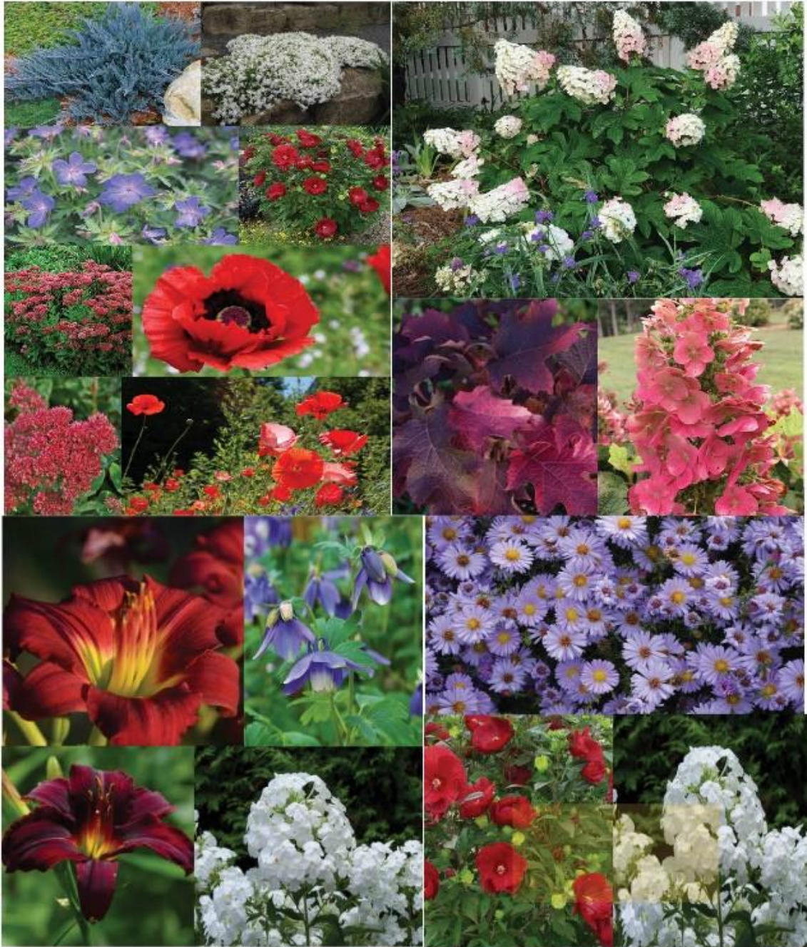
Juniper 'blue chip' , Creeping Phlox, Perennial Hibiscus, Icelandic Poppy, Sedum 'Munstead' Geranium 'Johnson's Blue'; Hemerocalis "Pardon Me" (May-June) Aquilegia 'Blue Butterflies'(May-July) H.'Indelible blood' (May -June); Phlox paniculata (July-Sept); Perennial Hibiscus with Smooth Blue Aster & Phlox pan.(Back side Garden)