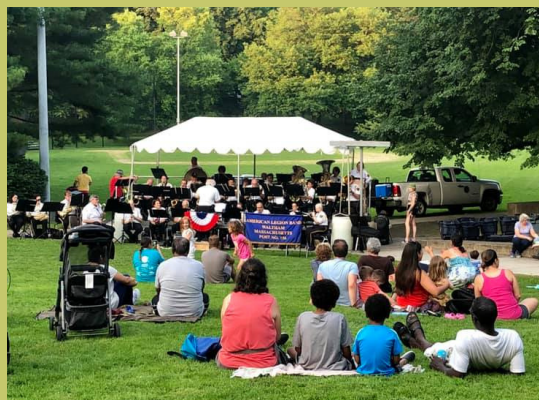
2019 Concert Series & 2021 Market Team

Visitors enjoyed another successful collaboration with the Free Summer Concert Series!